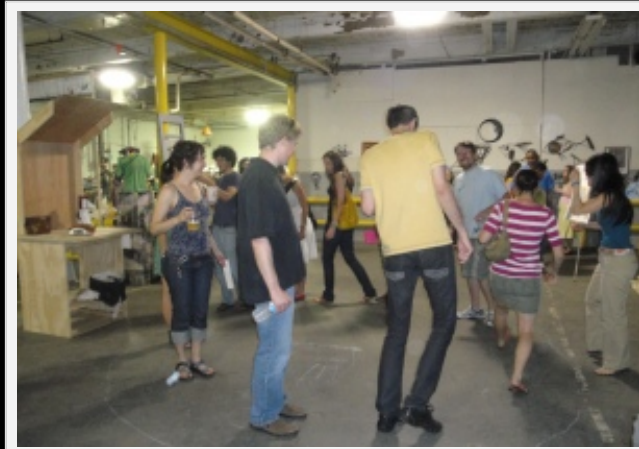
Life's a cake walk.

Anyways, between eating a fantastic burger from Only Burger, eating some great ice cream from The Parlour, stumbling around the Scrap Exchange, chatting with the artists in Golden Belt, and interviewing the Dogstar Folks for my Triangle ArtWorks article, it was quite a full evening! I had a great time, I always do. The events Golden Belt hosts really fosters a sense of community in the Durham cultural scene. Golden Belt is such a fantastic Durham institution and if you haven't visited you absolutely must go! Especially on a Third Friday!