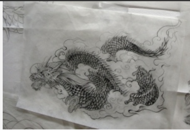
One last picture, dragon tattoo from Dogstar, for good measure!

This entry was posted on June 27, 2011 at 11:08 pm and is filed under Art , Durham , Food , Happenings in the City . You can follow any responses to this entry through the RSS 2.0 feed You can leave a response , or trackback from your own site.